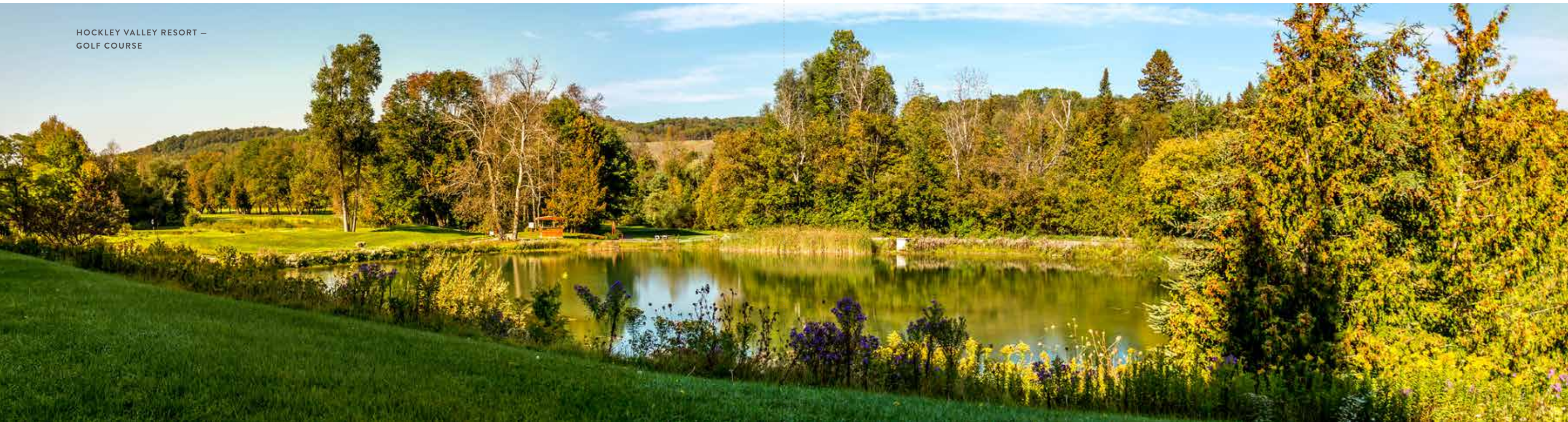
HOCKLEY VALLEY RESORT — GOLF COURSE

Hundreds of kilometres of trails and greenspace to explore.